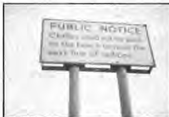
"Whatever your inclination" - even in January

Now the commuters of bankers and stockbrokers have been joined by a transient population of students and nubile foreigners learning English. The unlikely mixture conjures a town of contrasts - of antiques and avant garde.