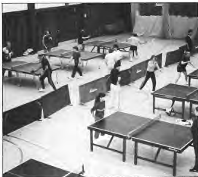
Group practice at the Crystal Palace course