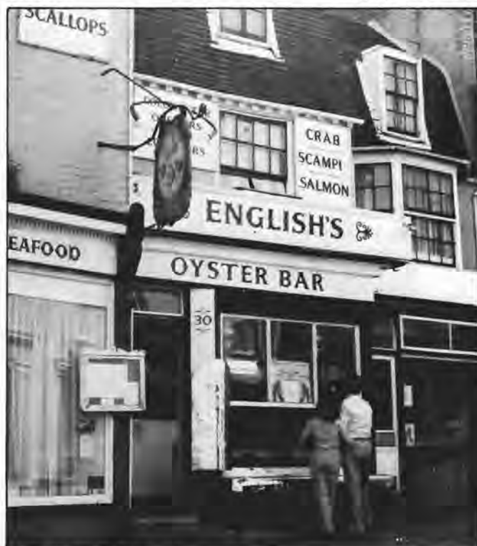
One of Brighton's many restaurants

You'll miss it on the telly. And the sea air.