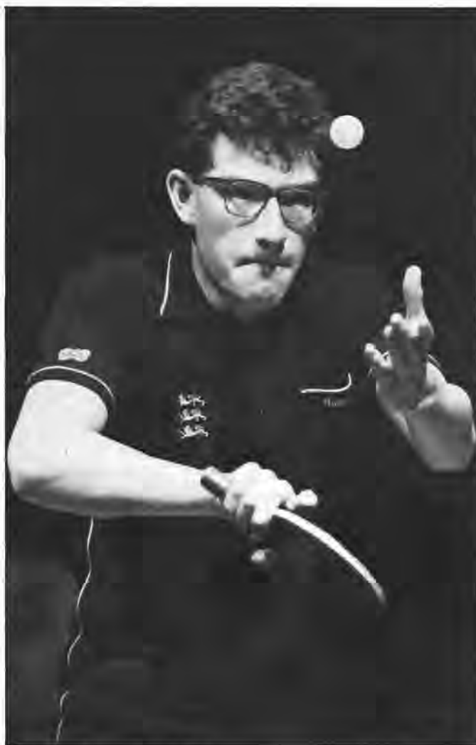
Prean — "fought manfully"

If, in such a contest, one can ever identify the true moment of defeat, it must surely have been at the end of this game — Bulgaria having saved 6 game points to clinch a 27-25 result. In the second game the English pair were literally knocked off the table.