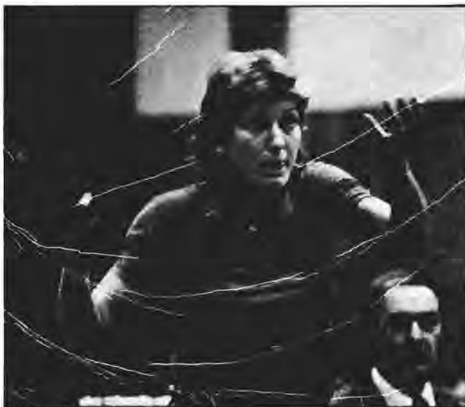
All serves another winner

There was also the deep-rooted TV suspicion of competitions without a final.